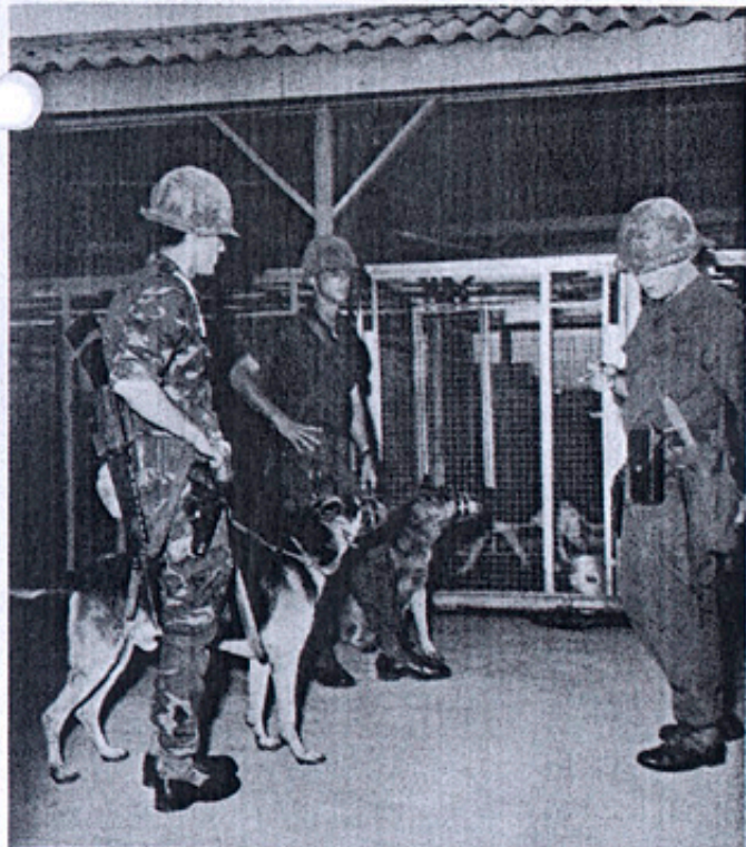
Armed with .38 caliber revolvers, M-16 rifles, grenades, sentry dogs and two-way communication sets, dog handlers prepare for night duty.