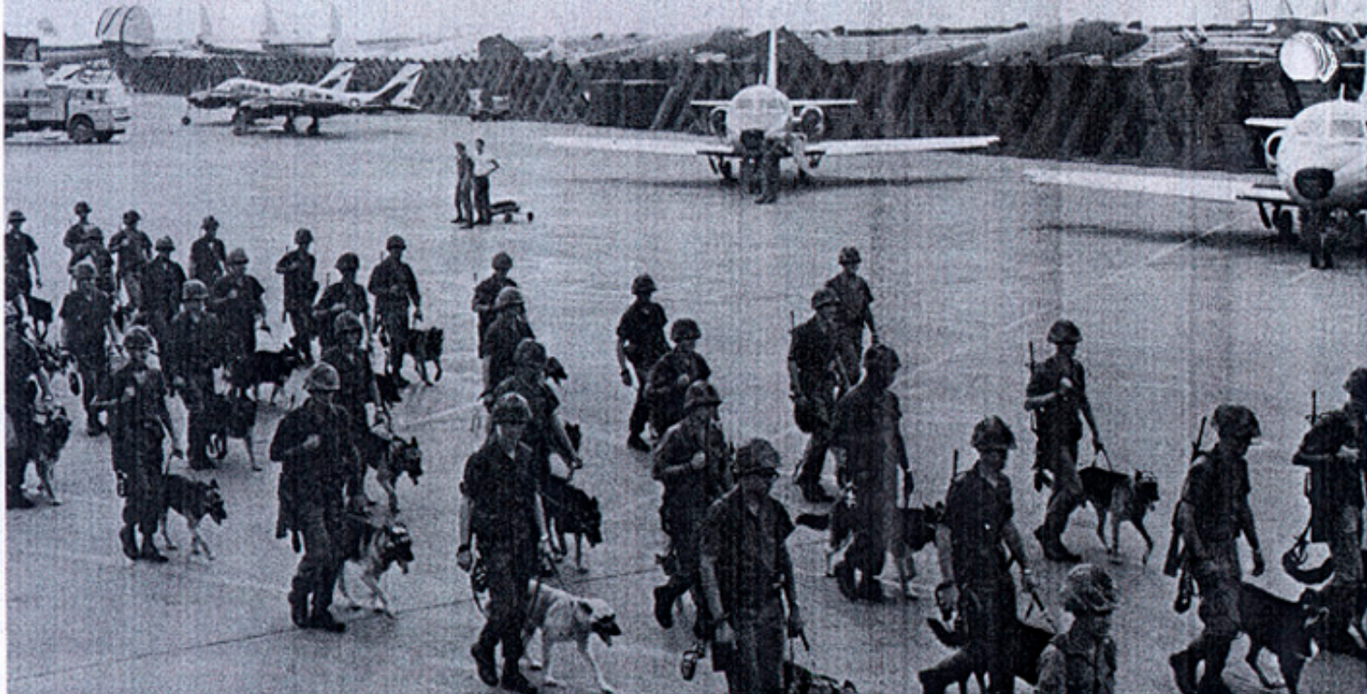
Air Force security policemen and their sentry dogs pass in review during rare formation photographed at busy Tan Son Nhut AB, Vietnam.

They patrol the perimeters. They have four eyes and four ears. They can smell the enemy. That's why